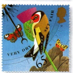
The stamps and the miniature sheet will go on sale at post offices, the British Philatelic Bureau and philatelic outlets on 13 March.

Four New Stamps feature aspects of the British weather. The colourful designs, placed together, form a barometer showing scenes of rain (19p), sunshine (27p), storms (45p), and very dry weather (65p). Users of the stamps will be intrigued by the creatures shown on three of the four stamps — cats and dogs on the 19p, a black-headed gull on the 45p and goldfinch and butterflies on the 65p. A tiny black Scottie dog also appears in the upper right sheet margin of the miniature sheet. The Queen's silhouette, printed in gold, is positioned top left on the 19p and 45p values and top right on the 27p and 65p. The four values cover the basic inland 2nd and 1st class rates and the two basic rates for overseas airmail letters.